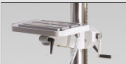
Optional MG rotating table with 3 T-slots for model X32