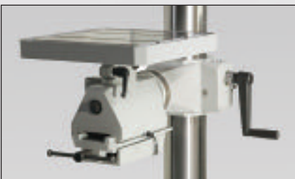
Optional MGM rotating table with 3 T-slots on one side and a vise on the other for model X34