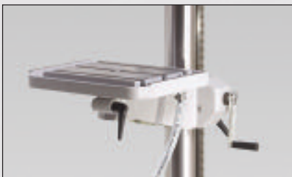
Optional MG rotating table with 3 T-slots for model Z32