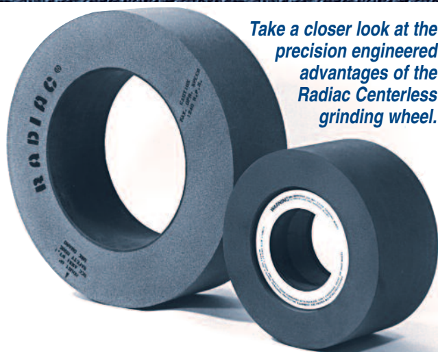
Take a closer look at the precision engineered advantages of the Radiac Centerless grinding wheel.

Including Regulating Wheels and Dressing Tools